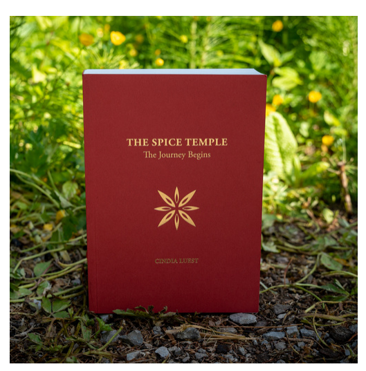
Literary or culinary fiction

The world of "The Spice Temple" is centered around a grand villa with a mysterious history. Transformed into a gastronomic temple, it welcomes or warns its guests. With the international cast, the stories allow audiences to travel and taste the unexpected while culinary creativity and cultures are explored – all inspired by some of the world's best chefs and resorts.